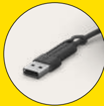
USB C and USB A connectors included