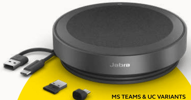
MS TEAMS & UC VARIANTS

To help consider our planet, we consider sustainability carefully at every stage of product development. The casing of Speak2 75 is made with over 33% sustainable materials 3 , and has a number of built-in parts that can be repaired or replaced. Better sustainability = longer speaker life = great calls for you and your team for years to come.