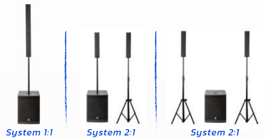
ACS-1200S Series application support